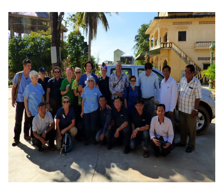
SSS Team members with Interpreters from Institute of Business at Char Pagoda.

Following discussion with our committee we decided that we should incorporate an increased active role in dental education, prevention and clinical care. Our focus during our primary health care clinics will continue to be the development of children from 0—5 years.