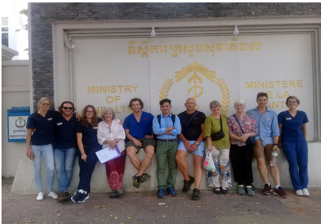
SSS Team January 2018 pictured outside Ministry of Health in Phnom Penh.