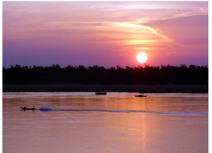
Sunset on the Mekong River.