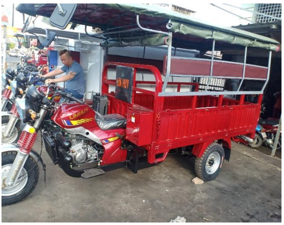
2.The end of Borei Keila