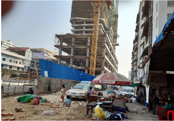
2.The end of Borei Keila