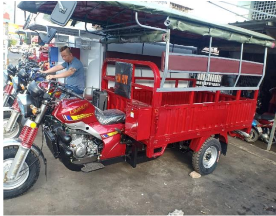
1.The Barang Mobile

And finally, a few pictures of our January trip.